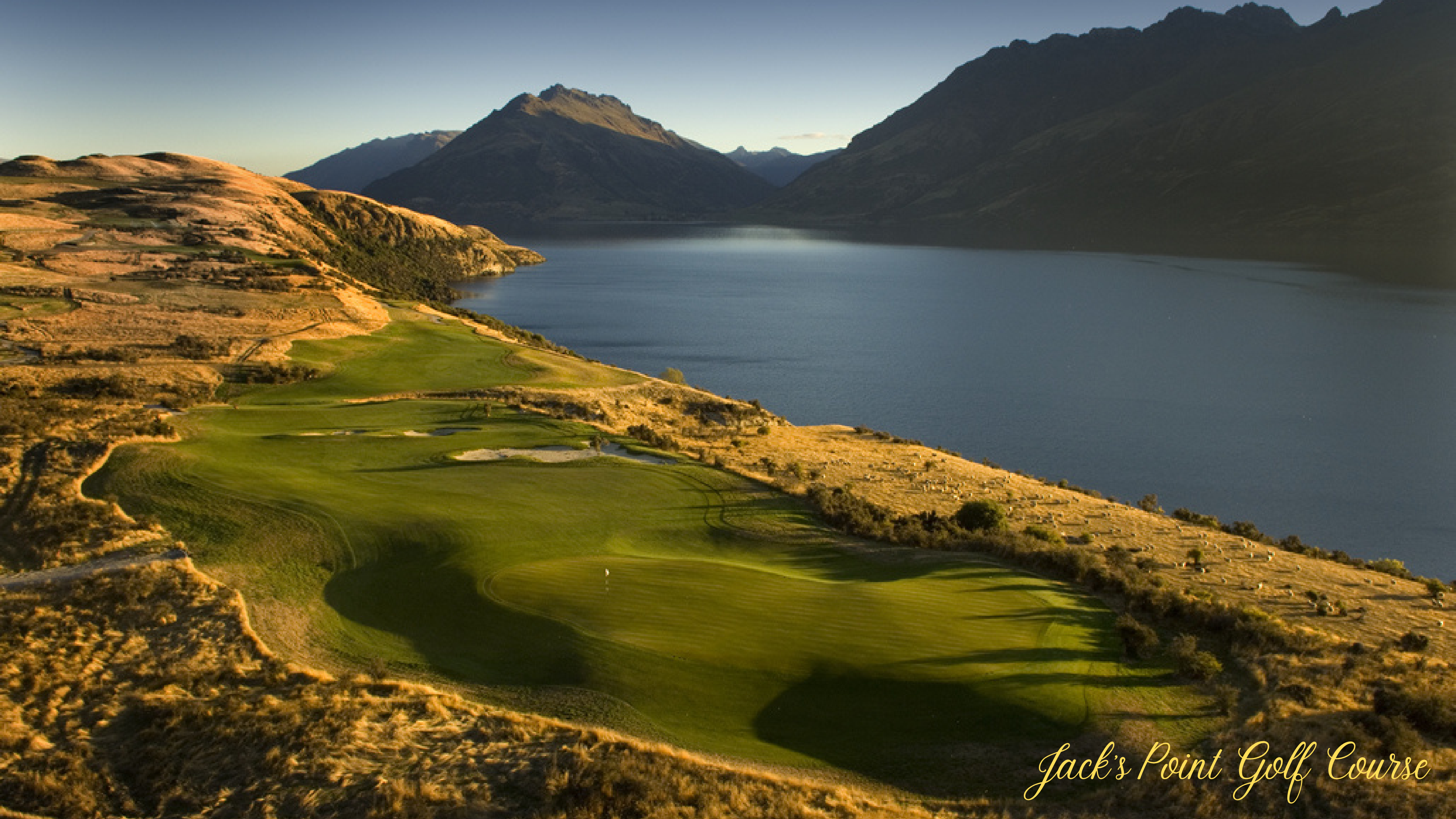
Jack's Point Golf Course