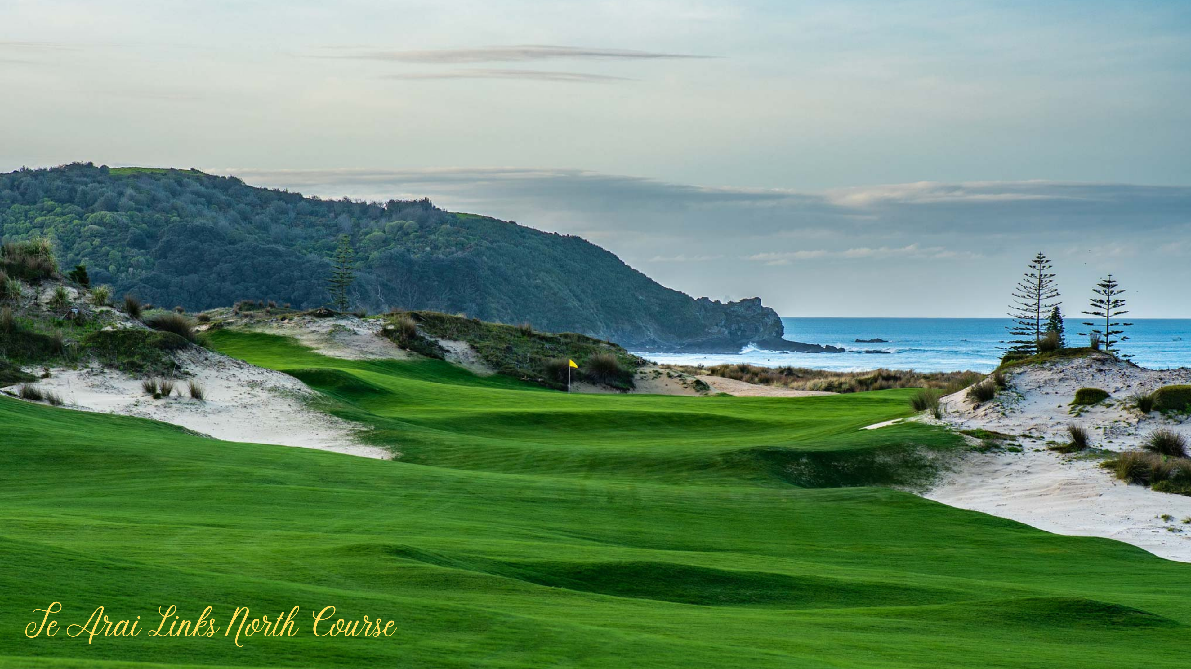
Le Arai Links North Course